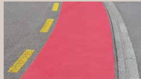
04 System: BASCObike