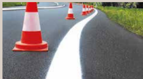
05 System: BASCOlin