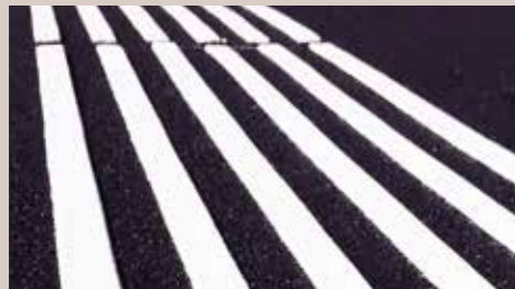
03 System: BASCOtaktil