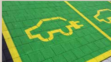
01 System: BASCOpaint

commitment, our reliability and our durability. We provide you with the optimal product for every purpose and a high-performance system for every application. We are an uncomplicated, reliable and flexible partner who is on your side.