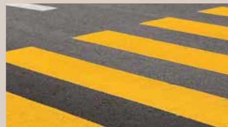
06 System: BASCOplast