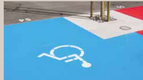
02 System: BASCOfield